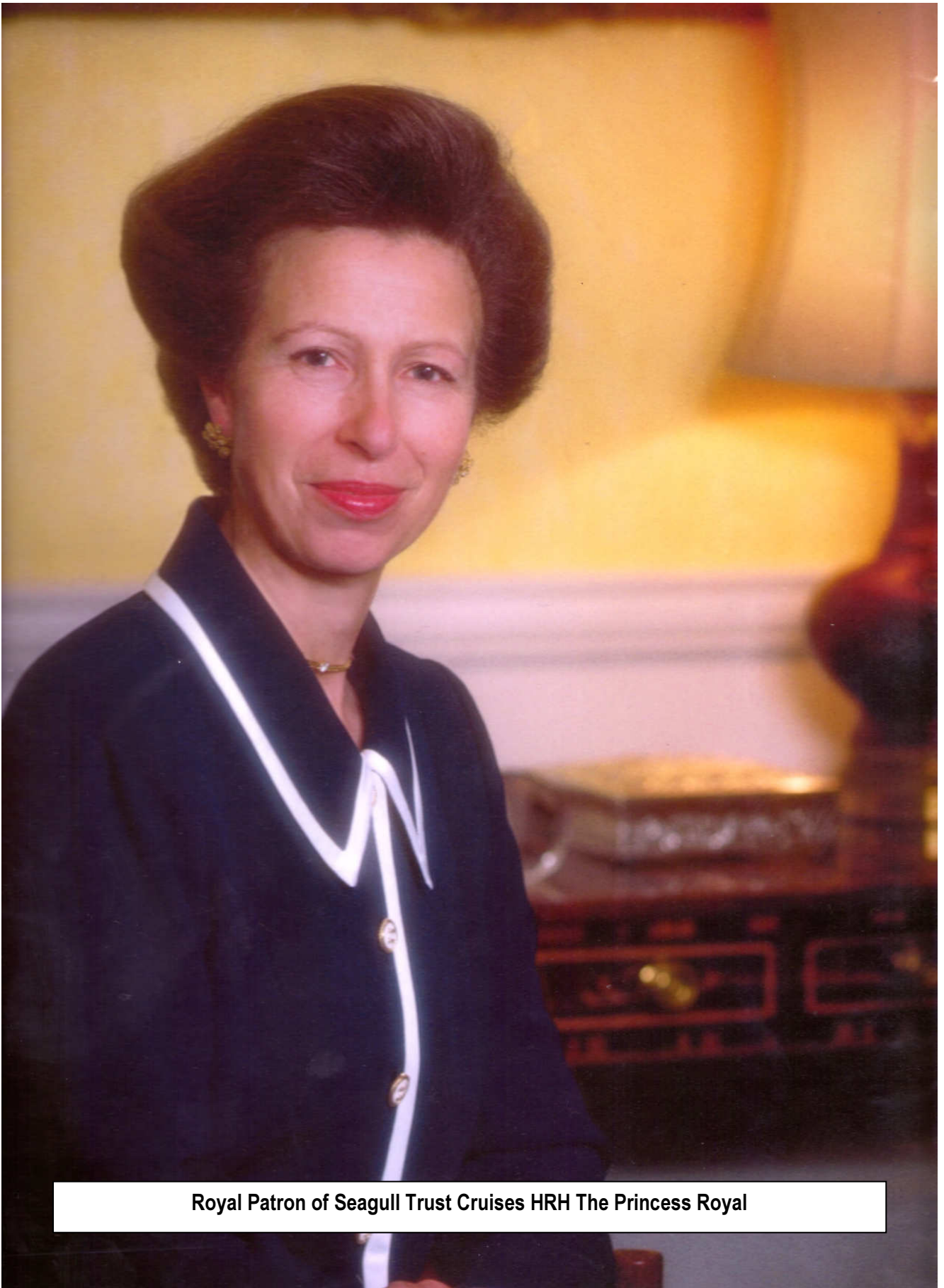
Royal Patron of Seagull Trust Cruises HRH The Princess Royal