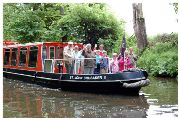
Children from Chernobyl are Welcomed Aboard

Email: fundraising@seagulltrustcruises.org